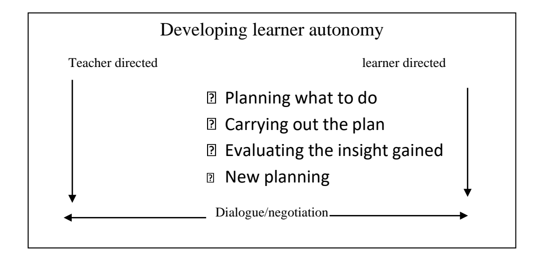
Figure 2: developing learner autonomy- a simplified model (Dam, 2007, p.14)

The picture below (figure 3) illustrated how autonomous classroom to be occurred. Both teacher and learner have the same role as a director of the learning progress. To begin with, teacher or trainer should recognize the characteristic of autonomous classroom before developing learning autonomy. Dam (2007) gives illustration how an autonomous learning circumstance to be occurred. He suggest that autonomous in learning require teachers and students roles. The four processes develop learner autonomy are attained through dialog and negotiation.