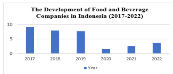
Figure 1. The Development of Food and Beverage Companies in Indonesia Source : (Badan Pusat Statistik Indonesia, 2017 - 2022)

Business development in Indonesia is indeed relentless. With the globalization era, business people are required to continue to make developments to be able to compete with other business people. The business sector in Indonesia is very diverse, there are automotive, pharmaceutical, textile, to food and beverage. Food and Beverage (FnB) companies are one of the industrial sectors in Indonesia engaged in the food and beverage industry where Food and Beverage companies have mushroomed in Indonesia. The following is a graph of the development of Food and Beverage companies in Indonesia according to the Badan Pusat Statistik Indonesia :