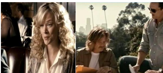
Figure IV. 8