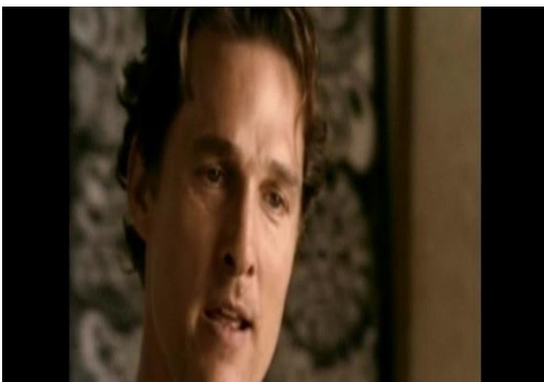
Figure IV. 9

Mickey Haller when share to Frank that he felt guilty to Jesus Martinez