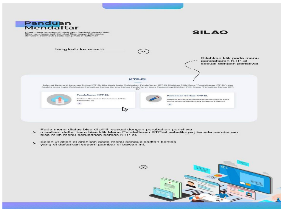
Figure 1. The Registration Instructions

Restrictions on Emergency Community Activities (lockdown) is a regulation that the government has implemented in order to protect the public from the 2019 Corona Virus Disease. Face-to-face services will be updated in accordance with the Population and Civil Registry Service's online services policy up until an unspecified time restriction expires. e-ID, family cards, civil registration certificates, child identity cards, change of address, arrival, and data synchronization are among the online services available. Situbondo's Population and Civil Registration Office is creating an online system for population administration service information (SILAO). Beginning on March 24, 2020, this program is in operation. In the midst of the ongoing pandemic, SILAO is designed to make it easier for applicants to register with the public population administration by avoiding the need for them to physically visit the Population Civil Registration Office. This is a guide for logging into SILAO. The Population and Civil Registration Office in Situbondo Regency is one of the regional organizations that offers population management services, including family cards, identity cards, birth, death, marriage, and divorce certificates.