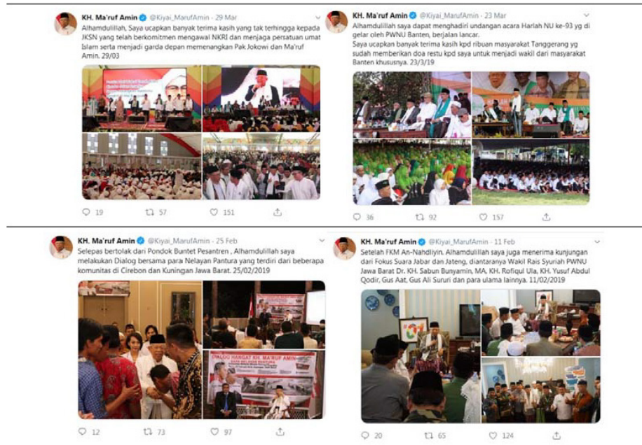
Figure 3. Visualization of Framing Campaigns at @kiyai_MarufAmin