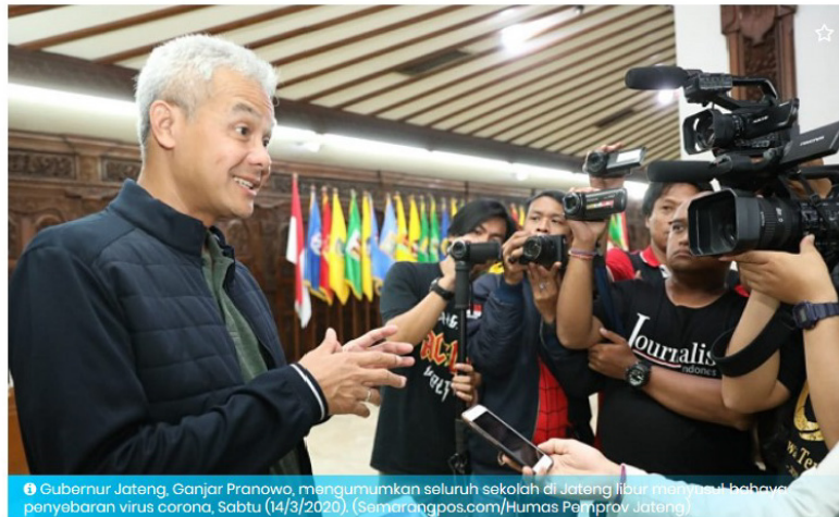
Figure 1. Solopos News March 15 th , 2020