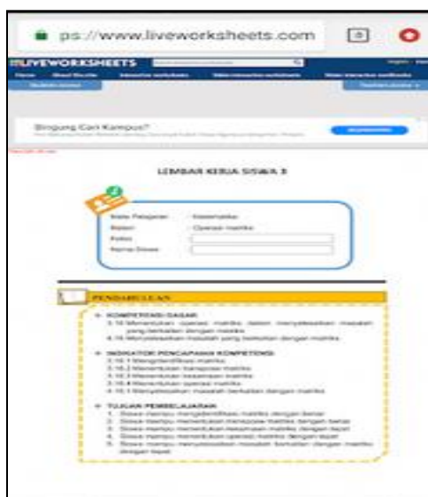
Figure 1. Initial View of e-LKS

The following is a picture of e-LKS with the help of a direct worksheet presented with Example-based learning.